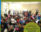
Building strong parent and child relationship